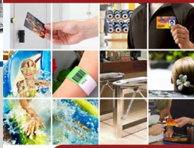
Wellness Control System Wellness, fitness, fürdő, múzeum beléptető rendszer