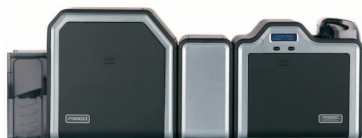
Lamination option and dual-sided printer/encoder