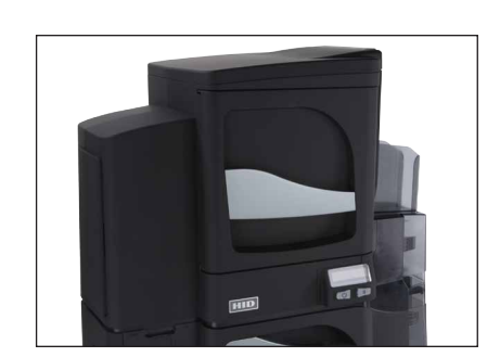
Custom overlaminates are available for a field-upgradable single- or unique, high-speed dual-sided simultaneous laminator.

The DTC4500 easily connects to PCs through its built-in USB and Ethernet ports. With its built-in internal print server, you can install a DTC4500 anywhere on a LAN for greater freedom when you are planning widespread or high-volume card issuance. Additionally, the DTC4500 is fully compatible with most ID card personalization software, including Asure ID®, which offers unique capabilities when used with HID FARGO printers.