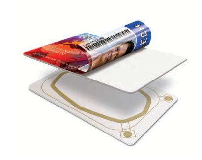
High Definition printing delivers the highest image quality —layered on the highest functioning cards. HDP Film fuses to the surface of proximity and smart cards, conforming to ridges and indentations formed by embedded electronics.

Cards produced by High Definition Printing are inherently more durable and secure than other types of cards. They resist wear and tear by putting a durable layer of HDP Film between the card image and the outside world. They're also tamperevident — if a counterfeiter tries to peel apart the layers, the image essentially destroys itself.