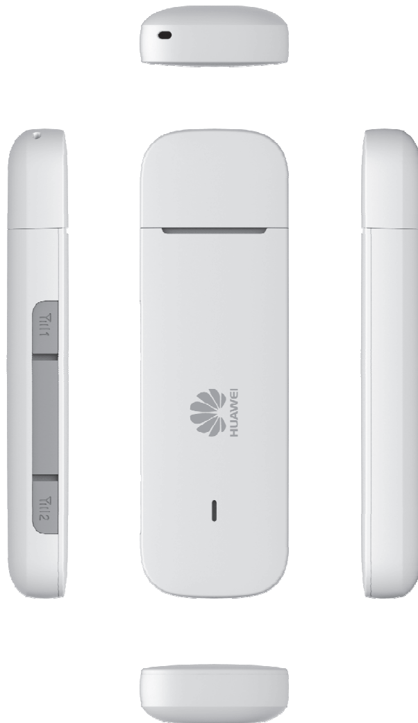
Figure 1-1 E3372h-320 appearance

In the service area of the LTE/DC-HSPA+/HSPA+/UMTS/EDGE/GPRS/GSM network, you can surf the Internet and send/receive messages/emails cordlessly. The E3372h-320 is fast, reliable, and easy to operate. Thus, mobile users can experience many new features and services with the E3372h-320. These features and services will enable a large number of users to use the E3372h-320 and the average revenue per user (ARPU) of operators will increase substantially.