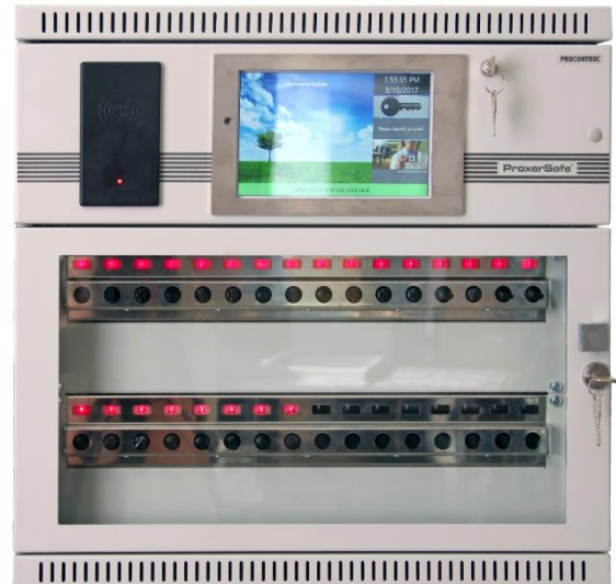
2 – KeySafe Lock 24/32 key cabinet