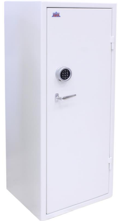
6 – KeySafe Security