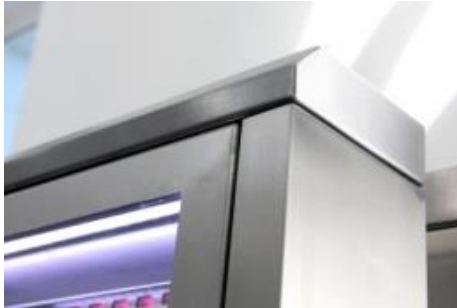
5 – KSLO outdoor brushed steel cabinet