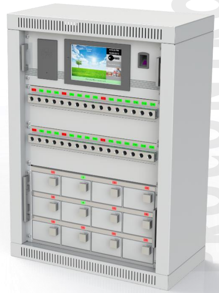
4 – ProxerSafe Combo with 32 key holder plugs and 12 small boxes

Systems can be integrated and managed with the same software module.