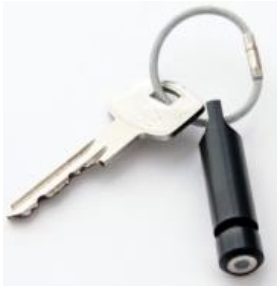
1 – RFID key holder plug and vandal-proof keyring