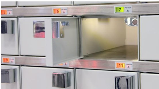
3 – Value storage boxes