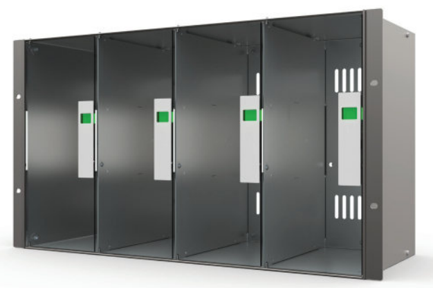
4BLP: 4 L-size boxes, plexiglass doors