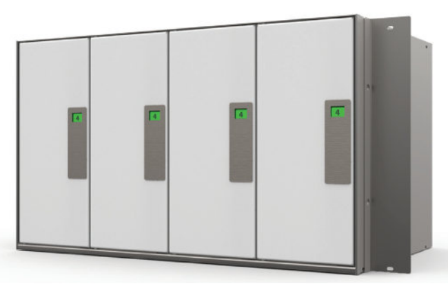
4BL: 4 x L size box, metal door